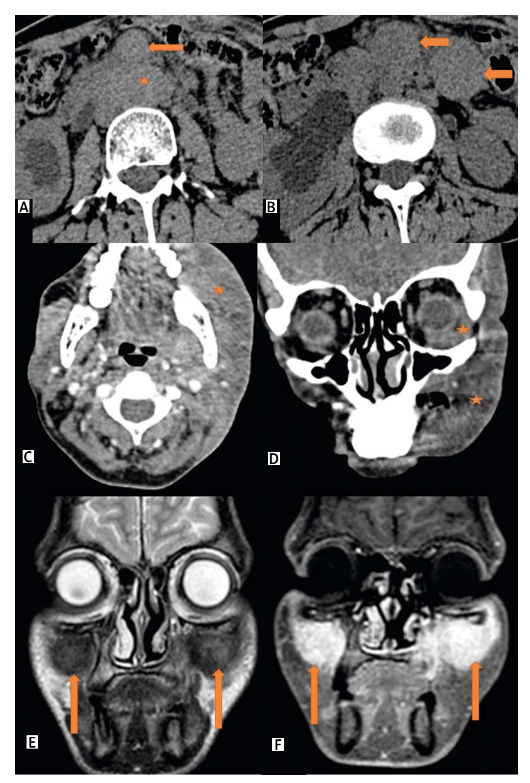
Fig. 1. Non-contrast computed tomography of the abdomen showing homogenous, sheet-like retroperitoneal soft tissue (*) around the abdominal aorta, with bilateral hydroureteronephrosis (A, B). Two separate peritoneal nodules are also seen (arrows). Unilateral left maxillary and periorbital soft tissue, which is uniformly hypodense on contrast-enhanced computed tomography images (*) (C, D). Another patient with bilateral maxillary involvement on T2W (C) and contrast-enhanced magnetic resonance imaging (D) images (arrow) (E, F).